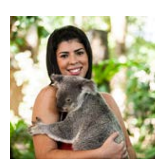
Lone Pine Koala Sanctuary